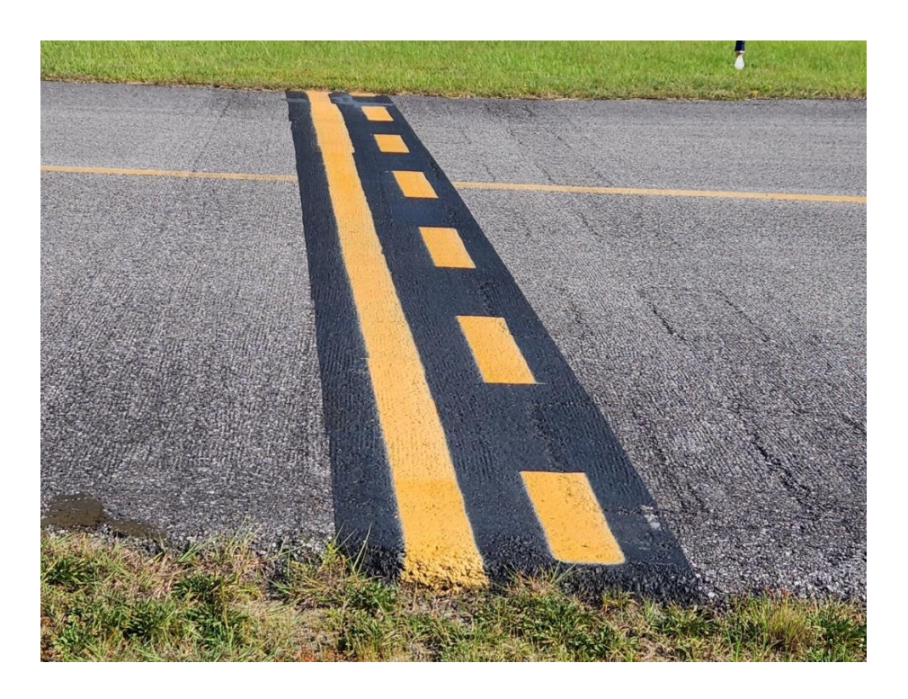
A single yellow solid line with single dashed line designates that you are entering onto a taxiway.