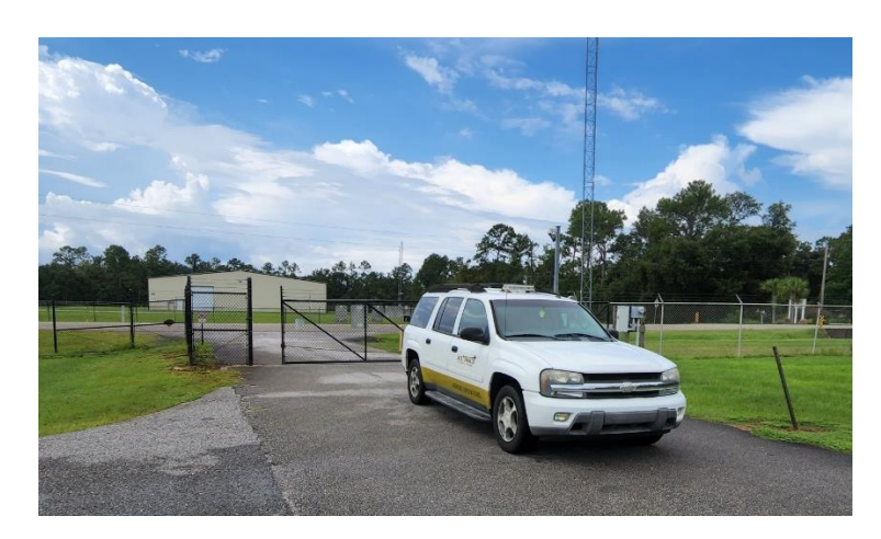
NEVER allow follow-through vehicles entering the airfield.

1.) Always wait for the gate to close behind your vehicle before proceeding into the Air Operations Area or when leaving the Air Operations Area. Failure to do so could result in loss of secured access privileges.