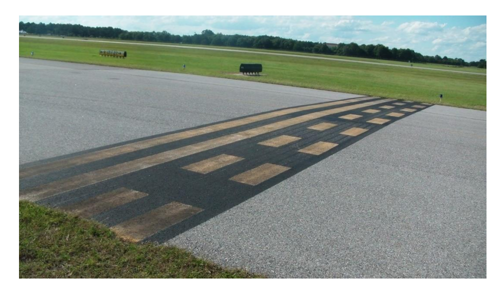
A double yellow solid line with two dashed lines designates that you are entering onto a runway.

An <u>Incursion</u> in the Movement Area is a very serious offense and must be reported to the FAA.